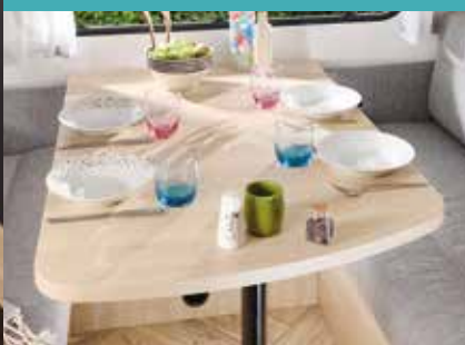
Table Sport Line