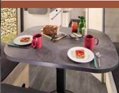
Table Exclusive Line