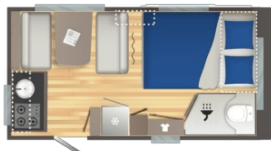
SPORT LINE 410

3 ↔ 5.95m Maxi authorised 1100 weight (Kg.)