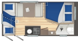
SPORT LINE 476

3 ↔ 5.95m Maxi authorised 1100 weight (Kg.)