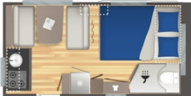
SPORT LINE 410

3 ↔ 5.95m Maxi authorised 1100 weight (Kg.)