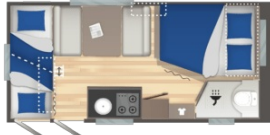
SPORT LINE 476

3 ↔ 5.95m Maxi authorised 1100 weight (Kg.)